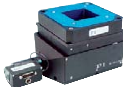
P-562.3CD PIMars™ XYZ piezo-nanopositioning & scanning system (200 μm x 200 μm x 200 μm) mounted on an M-451.1PD elevation stage