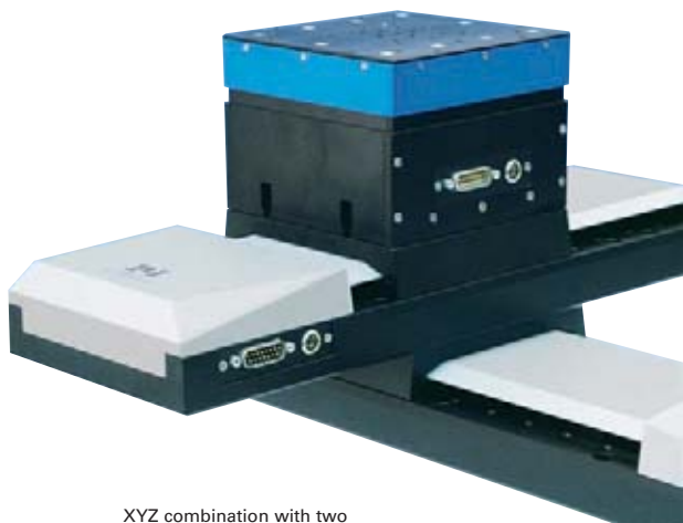
XYZ combination with two M-511.DD linear stages and an M-501.1PD precision vertical stage